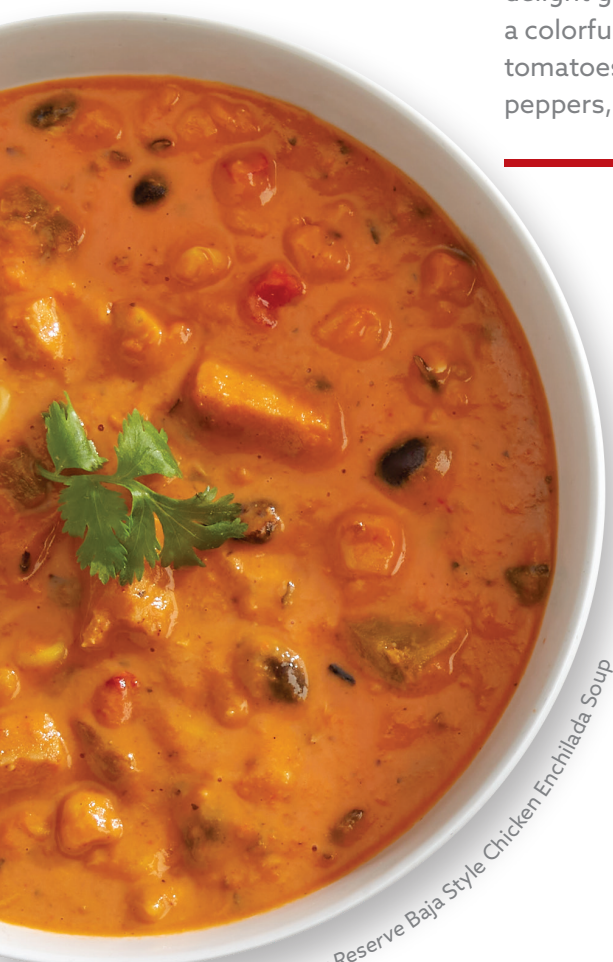
Campbell's® Culinary Reserve Baja Style Chicken Enchilada Soup

This Mexican-inspired soup is the perfect way to delight guests with bold, on-trend flavors. It features a colorful medley of vegetables, including diced tomatoes, corn, jalapeño peppers, red and green peppers, black beans and tender chunks of chicken.